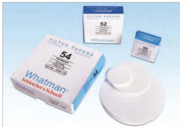
Hardened Low Ash Grades

Very fast filtration for use with coarse and gelatinous precipitates. High wet strength makes this grade very suitable for vacuum assisted fast filtration of 'difficult' coarse or gelatinous precipitates.