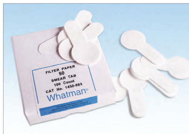
Surface Wipes – Smear Tab